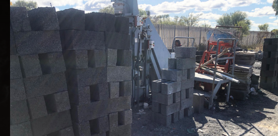
Baheso Brick Making and Multipurpose Cooperative - Page 15