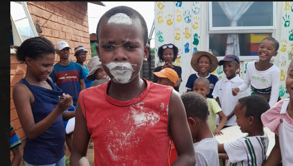
Zenisha Play & Learning Centre - Page 25