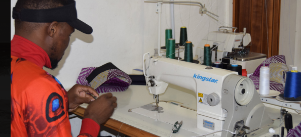
Ubunele Primary Cooperative Limited - Page 23